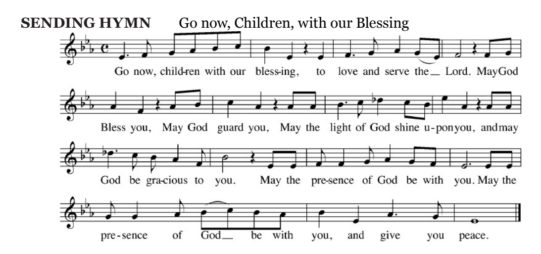
During the Sending Hymn, kindergarten through 3rd grade children depart for their Sunday School classes.