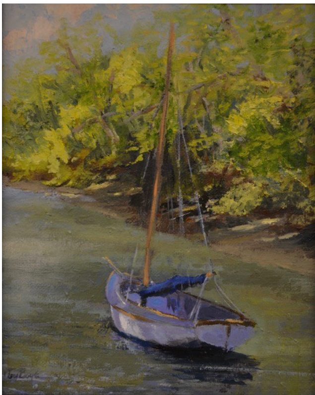
Lazy River , oil