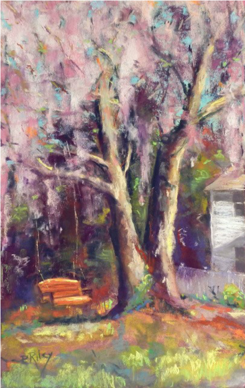
The Swing , pastel