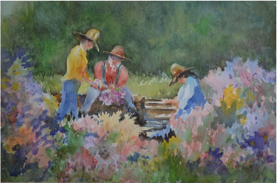
Three Hats in the Garden , watercolor